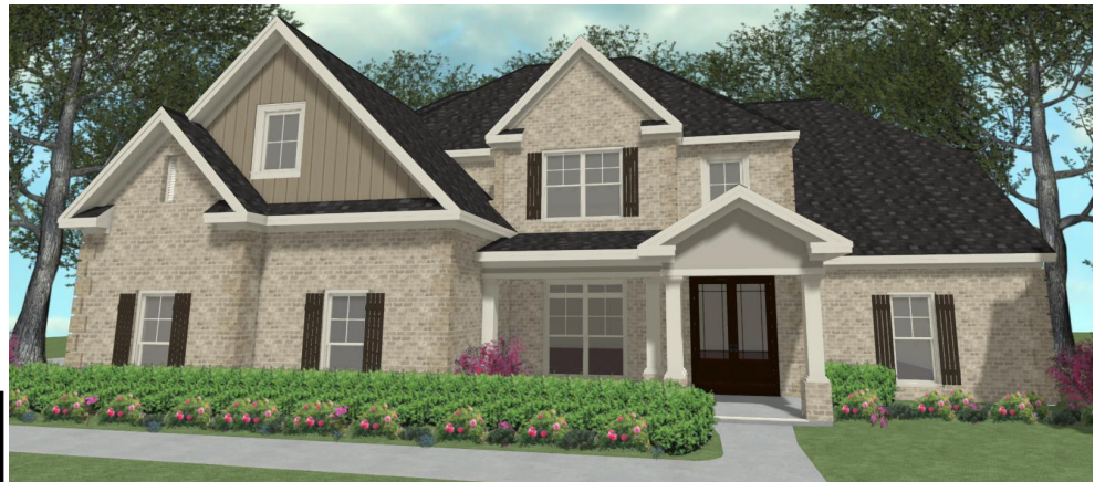
ELEVATION OPTION 3