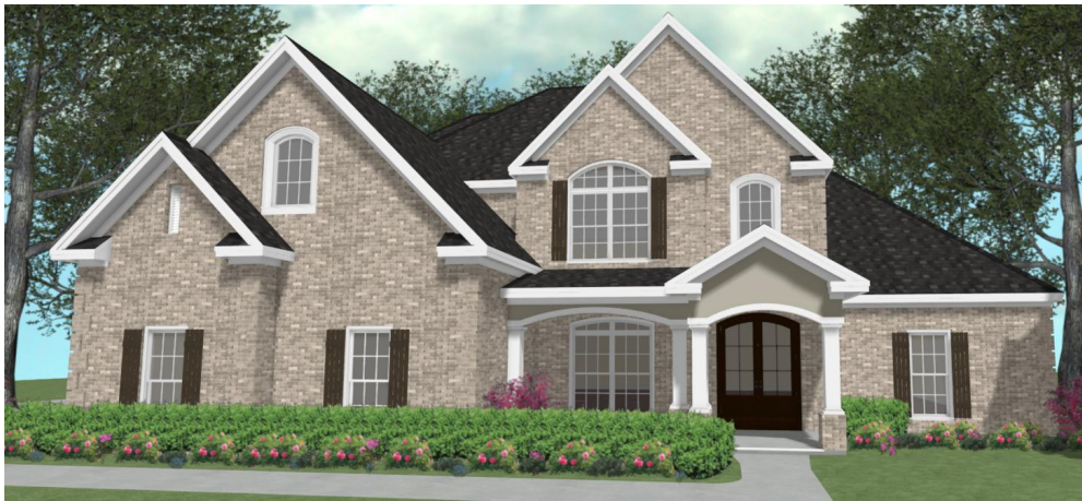
ELEVATION OPTION 1 (STANDARD)