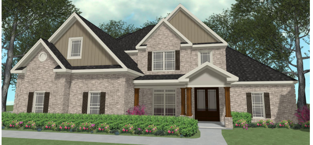
ELEVATION OPTION 2